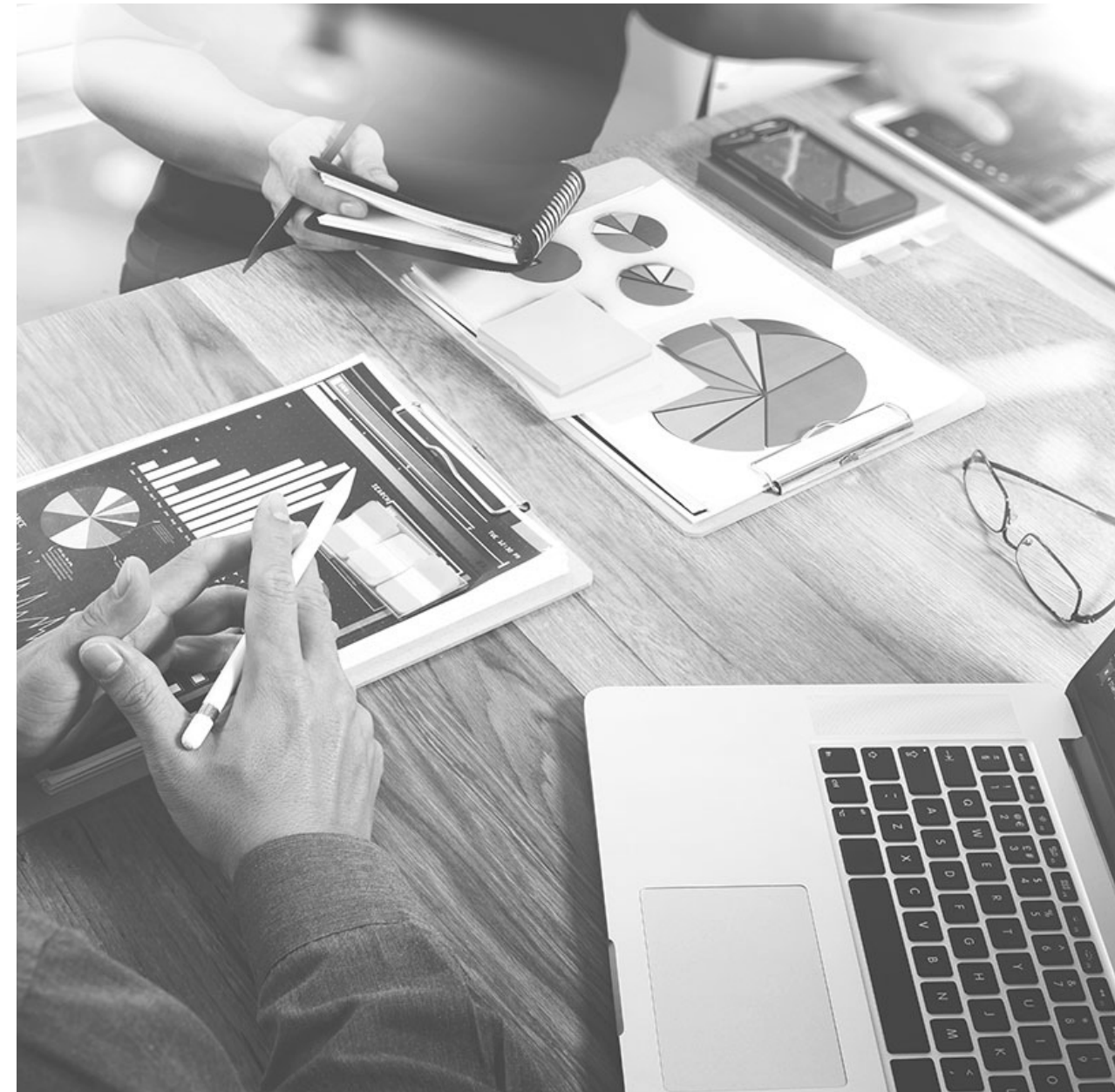
IMPROVING MARKETING STRATEGY