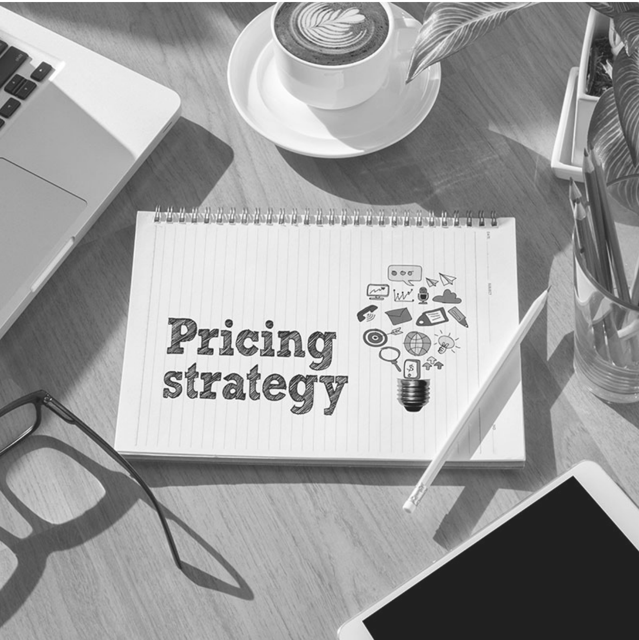
IMPROVING PRICING STRATEGY